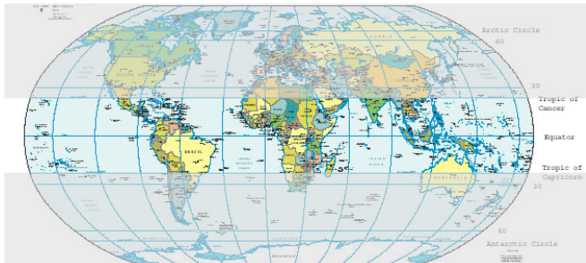
The Tropics is the uncovered area

The Arctic Circle is a large area around the North Pole. It is also cold all year long. Polar bears live in the Arctic Circle.