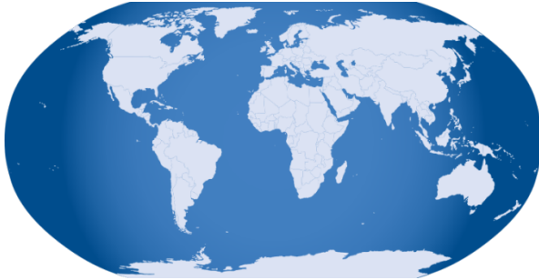
Antarctica is the continent at the very bottom of the map

Not all parts of the world have seasons like winter, spring, summer and fall. Some areas are cold all year long. Some areas are warm all year long. Some areas have hot seasons and rainy seasons.